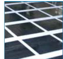
Full square semi-crystalline EFG cells ensure maximum energy yield.