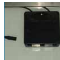
ASE-270-DGF/50 diode housing with bypass diodes, UV resistant cables with MC®-connectors.